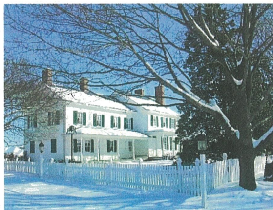
1790-1830 Schenck House, 50 Southfield Rd.,